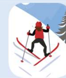
Uphill Technique 2