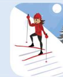
Uphill Technique 1