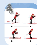
Kick Double Pole