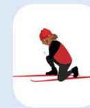
Falling & Rising