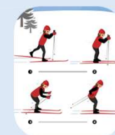
Kick Double Pole