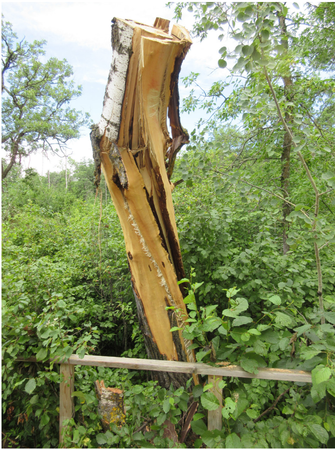
The twisted and debarked tree that crashed onto the bridge

When trail clipping crews were able, many of the volunteers clipped the overhanging hazel bushes to a trim line, better than ever before. The classic trails were a sight to behold! Unfortunately, the first snowfall of the year was a major snowstorm of heavy wet snow which piled up and pushed many saplings and bushes over our pristine trails, blocking them once again. It has been the worst that our old timers can remember. To make things even more difficult, a number of mature trees which had survived the summer storm now came crashing down under the snow load. Once more we relied upon Jason and his chain saw, supported in difficult conditions by yet more crews of workers. Eventually, working with two grooming machines in tandem, and crews of four men, our trails are once again open, base packed, groomed, and ready for skiers