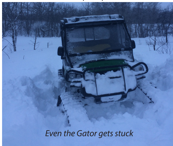
Even the Gator gets stuck