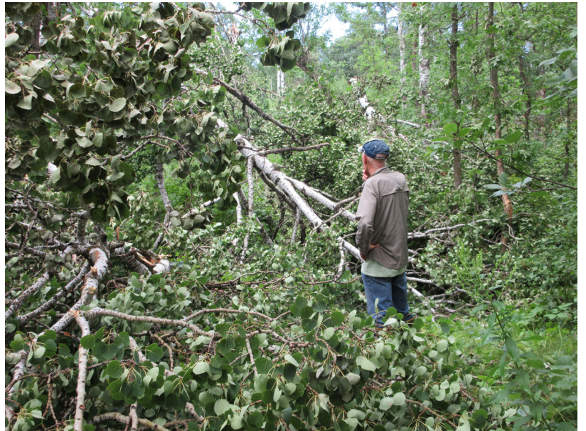
Where's the trail?