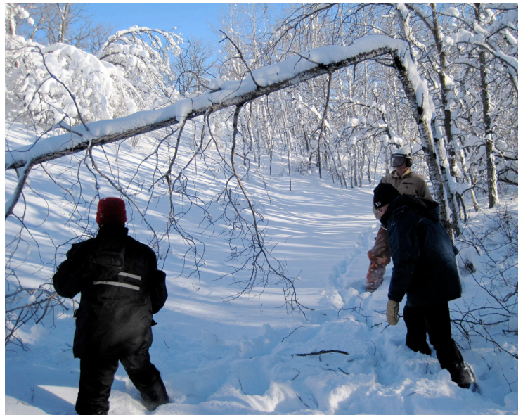
Opening yet another blocked trail