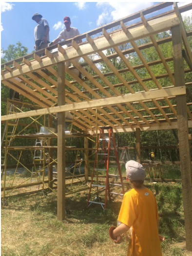
Corey, Jason and Ross building the rafters

It seems that at Bittersweet we are always busy! This summer began with the construction of a building to house the Club machines, up to now stored at Hartley Woodward's. Glen McMaster generously funded the project, Scott Smart donated a small mountain of lumber, and an army of volunteers pitched in to construct in short order a metal clad shed large enough to house both tractor and Gator. The building stands behind Corey's home, and skiers can see it as they pass on the nearby trail. We are grateful for all those whose help made this possible.