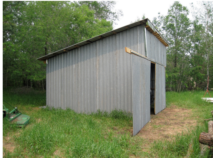
The new shed, side view