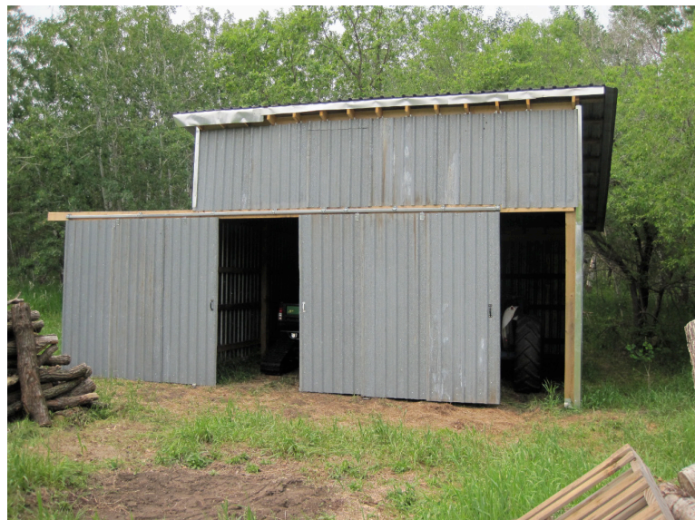
The new shed has two doors to accommodate both the tractor and the Gator.